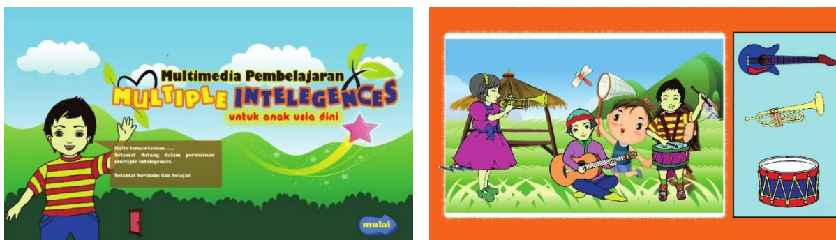
Figure 2: Examples of multiple intelligences multimedia

design. In the development of the multimedia used some consideration of learning theories and the underlying studies. For the media aspects, behaviourist perspective was commonly used, as it was seen from the modelling shown and also the repetitions given. In addition, this multimedia referred the users to follow the authors' mind indirectly. In the step of delivering the materials, the authors tried to use the perspective of cognitive-constructivist theory. The material itself was made to improve children's multiple intelligences.