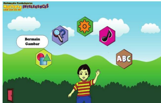
Figure 1: Example of prototype multimedia

The last step was that to create the prototype of multiple intelligences learning multimedia. The prototype was arranged in accordance to the story board that had been developed on the previous steps.